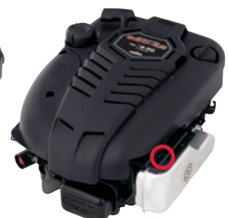
600 Series™, 800 Series™ Quantum®, Intek™