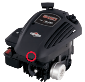
400 Series™, 500 Series™ Classic™, Sprint™, SO™, Q™